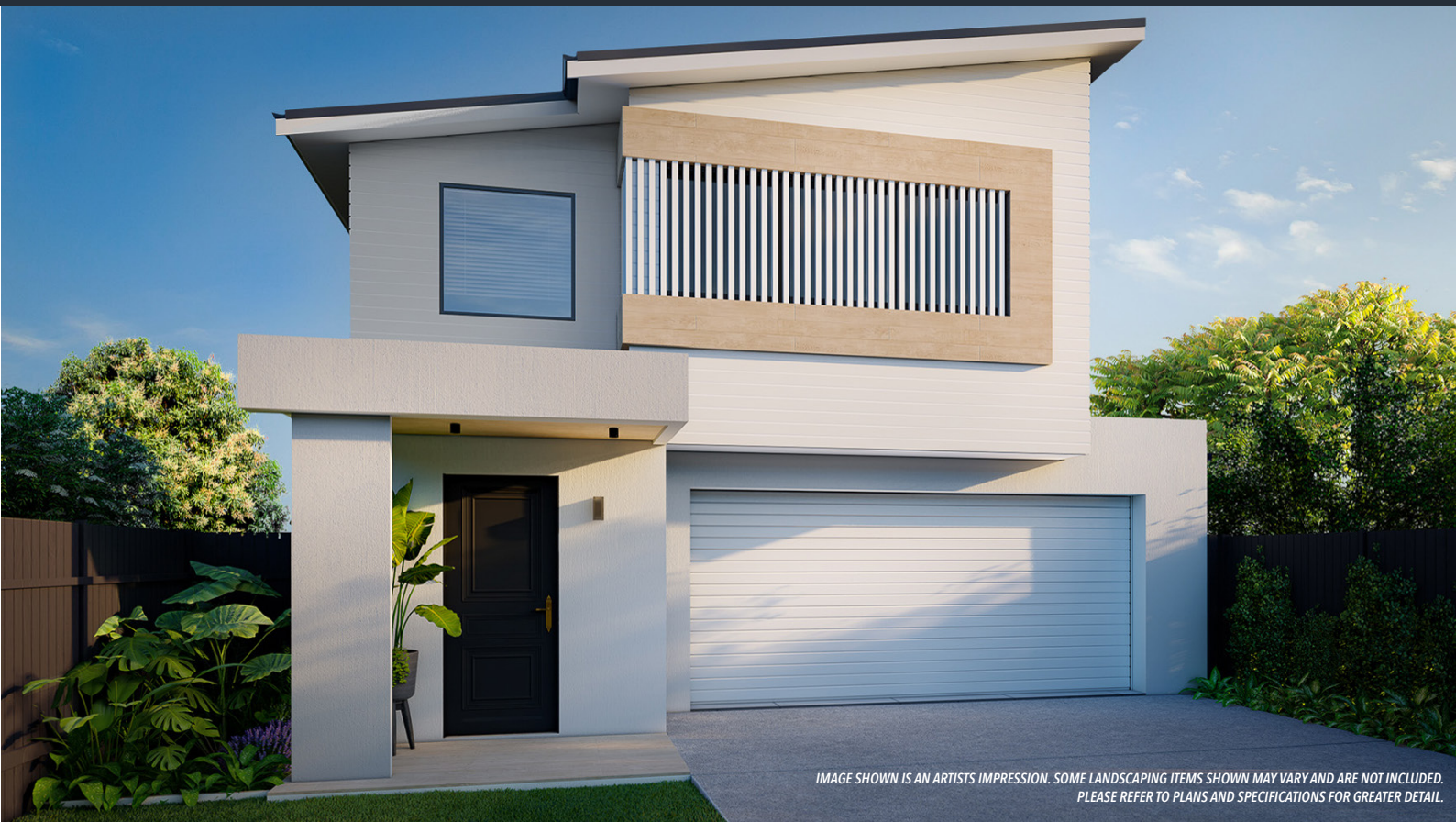
IMAGE SHOWN IS AN ARTIST'S IMPRESSION. SOME LANDSCAPING ITEMS SHOWN MAY VARY AND ARE NOT INCLUDED. PLEASE REFER TO PLANS AND SPECIFICATIONS FOR GREATER DETAIL.